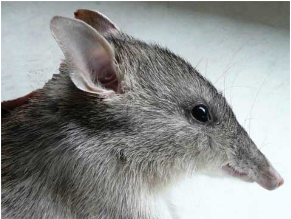
Adult Long-nosed bandicoot Parameles nasuta