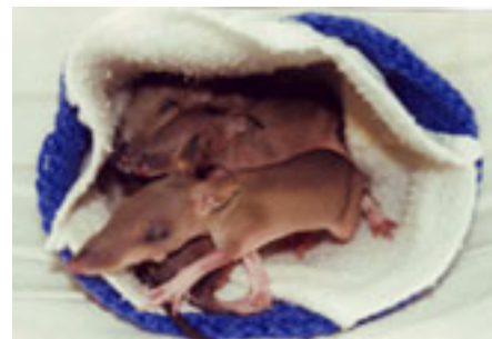
30g, skin no longer tacky. Eyes closed. Can be hand-reared by experienced carer

Pouched young or small juveniles will also require some additional heat depending upon their age and size. Unfurred or just furring young should be placed in a beanie that is secured with a tie or elastic band at the neck. This beanie should be placed alongside a suitable heat source - warm hot water bottle, warmed wheat bag or whatever heat source you use. Remember - not too hot, just warm enough. It is better to err on the cool side than overheat the animal.