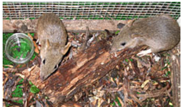
86 days old. About 300g Leaf litter and rotted wood with insects such as beetles, wood lice etc.

Aviaries need to have firm flooring otherwise the animal will dig its way out very rapidly. Concrete or brick flooring can be covered with artificial grass that is itself covered with a deep layer of dirt and leaf litter. The soiled litter can be changed every few days but care must be taken not to interfere with the area in which the animal has constructed a mound. It is also advisable to place a barrier on the lower section of the aviary wire so that the animal does not damage its nose attempting to find a way through.