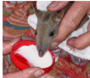
65g. Lapping milk from bottle top