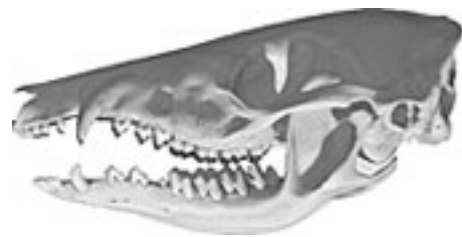
Bandicoot skull Texas Memorial Museum

The Northern Brown Bandicoot Isoodon macrouris is very similar in appearance to the Southern Brown, One can easily confuse them. However, Isoodon. macrouris is found only from the Central Coast area and further north and Isoodon. obesulus is found only on the southern coastline of Australia..The fur colour is brownish with speckled black patterns throughout. On the under surface it is solid white. This bandicoot also has short, rounded ears, a short nose, and brown feet