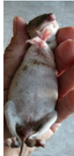
Bloated 45g bandicoot

The fluid collection is associated with a stagnation of blood in the veins of the abdomen and peritoneum, whereby an oozing of the fluid constituents of the blood into the peritoneal cavity can occur. This stagnation may be caused through a faulty heart action, or through some obstruction to the free flow of blood in the abdominal veins. When an excessive amount of fluid collects in the abdominal cavity, it causes fluctuating swelling and results in disturbances of digestion, nutrition and heart action, and sometimes respiration.